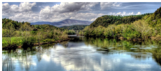
A Place at the Table

Fall Retreat — The Women's Ministry of CPC is excited to announce a two-night retreat that will be held this fall in the beautiful Blue Ridge Mountains at Ridgecrest Conference Center. Dates for this retreat are November 4-6. Meals will be provided and there are several bunking options listed on the sign-up sheet. We are looking forward to spending a weekend together in: Prayer, Fellowship, Intentional time with the Lord, Stillness in the Blue Ridge Mountains in the Fall, Growing in relationship with Christ and one another, and more!